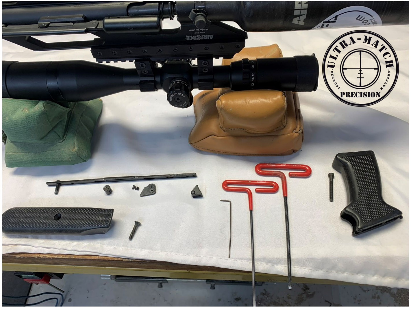
For trigger installation, skip to page 14